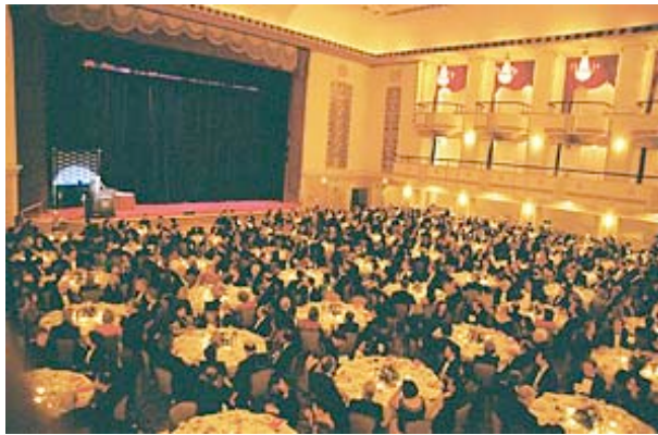
Grand Ballroom, The Waldorf=Astoria

©2005 Asia Society | 725 Park Avenue at 70th Street NY, NY 10021 | 212-288-6400 | Press Releases | Contact | FAQ | Become a Member