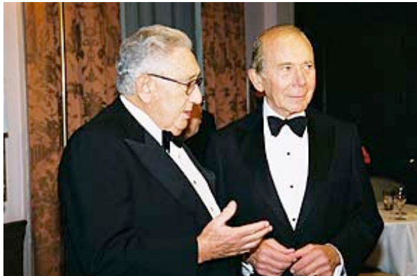
Henry Kissinger, Maurice Greenberg